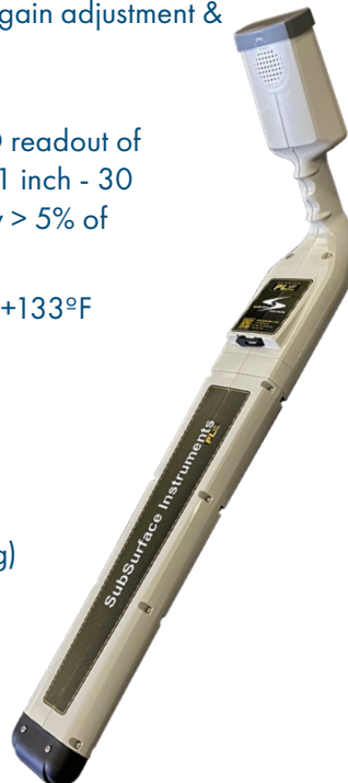
PL - VF VARIABLE FREQUENCY RX